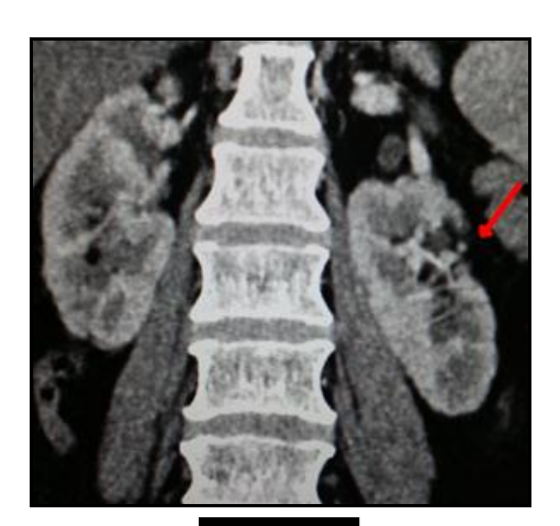
Fig. 2: Coronal reconstruction of contrast enhanced CT image in arterial phase shows two normally located kidneys on either side and supernumerary kidney fused to the lower pole of the left kidney (Depicted by arrow).